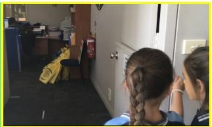
Office Procedure Example