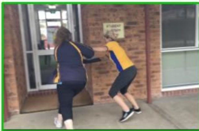
Office Procedure Non-Example

So far these videos, the non-example in particular, are getting many giggles each morning. Students who display the daily focus consistently can earn their first goanna of the year. We have also created a new office procedure to assist the students in understanding the expectations when they are in the office.